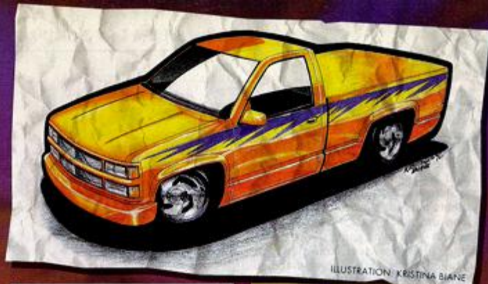
ILLUSTRATION: KRISTINA BIANE